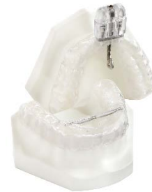
Figure 1: TAP 1