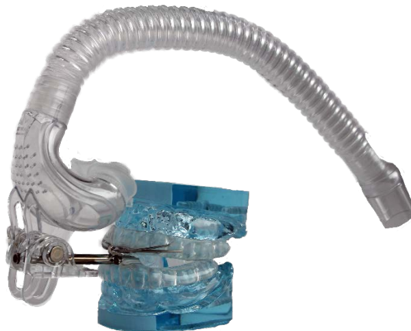
TAP PAP CS w/dreamTAP

Many DSM dentists use the TAP PAP CS to help bridge the gap between the MD and DDS/DMD. It allows the dentist to discuss oral appliance therapy with the MD with a collaborative tangible device. Helping to create a positive working relationship between the two branches of medicine needed to treat OSA.